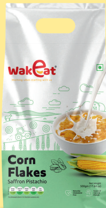
Corn Flakes Saffron Pistachino