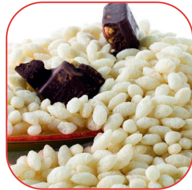
Rice Krispies Oval