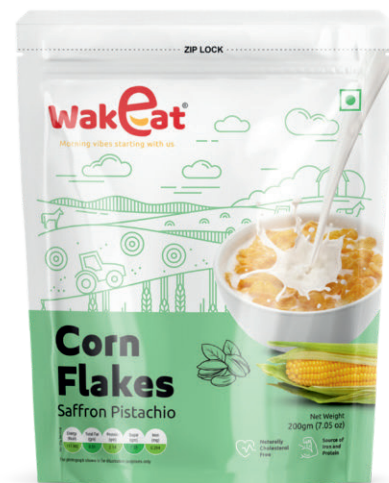
Corn Flakes Saffron Pistachio