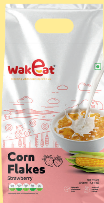
Corn Flakes Strawberry