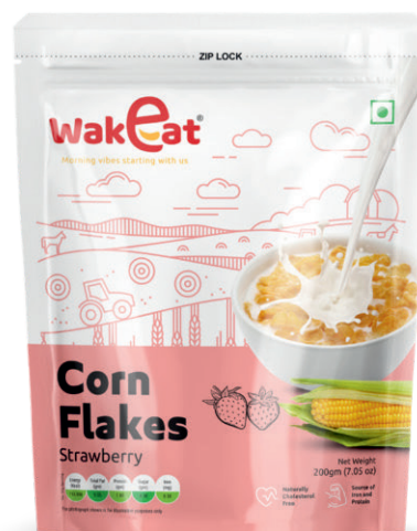
Corn Flakes Strawberry