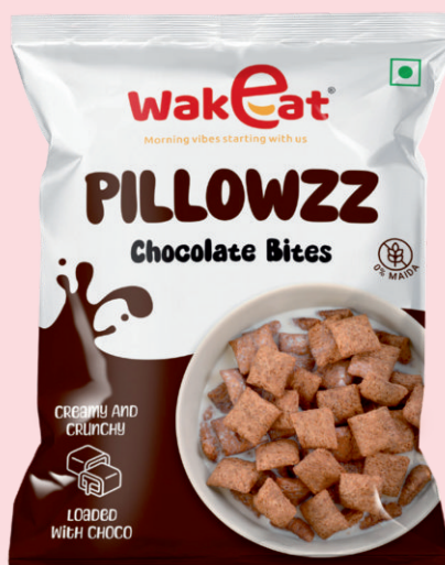
PILLOWZZ Chocolate Bites