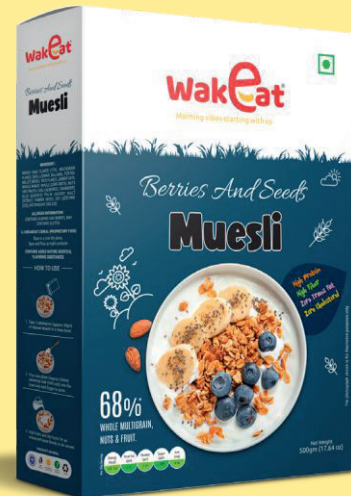
Berries and Seeds