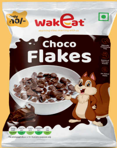
Choco Flakes 10 Rs. Pouch