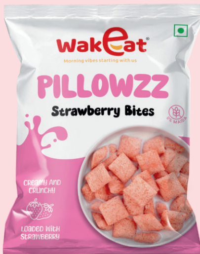
PILLOWZZ Strawberry Bites

Made with whole wheat, providing a wholesome snacking experience Comes in four delicious flavors of Mango, Strawberry, Orange, and Vanilla Contains 0% Maida and no added Maida for a guilt-free snacking experience Low in fat and rich in dietary fiber and protein, making it a nutritious choice Free from added preservatives, ensuring a natural and healthy snack Provides a satisfying crunch, making it a perfect snack for any time of the day Tastes great and offers a healthy snacking option for those on the go WAKEAT Fruit Rings are a perfect blend of taste and health, making them an ideal choice for health-conscious consumers Enjoy the sweet taste of fruits and the goodness of whole wheat with WAKEAT Fruit Rings Make WAKEAT Fruit Rings a part of your daily routine for a tasty and healthy snack option.