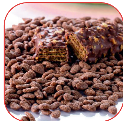
Rice Krispies Choco Oval