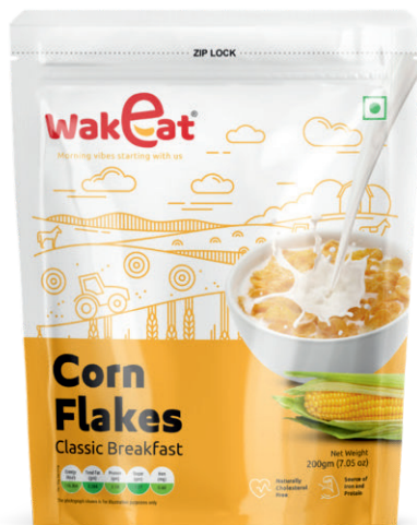
Corn Flakes Classic Breakfast

Wakeat makes the best quality Corn Flakes, Hence, we are recognised as the leading corn flakes exporters and corn flakes manufacturers in India. If you want to super change your body, you should start your day with a bowl of crispy corn Flakes. Corn flakes are beneficial not only to your physical health, but also to your mental health. The extraordinary nutritive qualities of corn flakes make them an ideal choice for breakfast. Also, corn flakes are one of the most convenient breakfast options. Just add a little quantity of milk and fruits, and the yummy treat is ready!