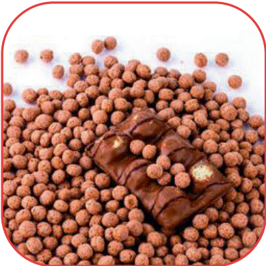
Rice Krispies Choco