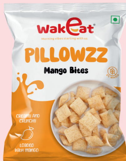
PILLOWZZ Mango Bites