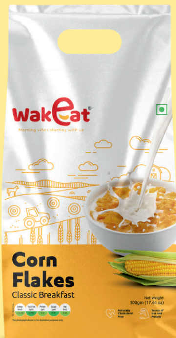
Corn Flakes Classic Breakfast

375gm, 500gm, 1kg bag, Bulk : 15kg Loose